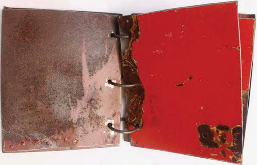
Veronica Vides - El Salvador