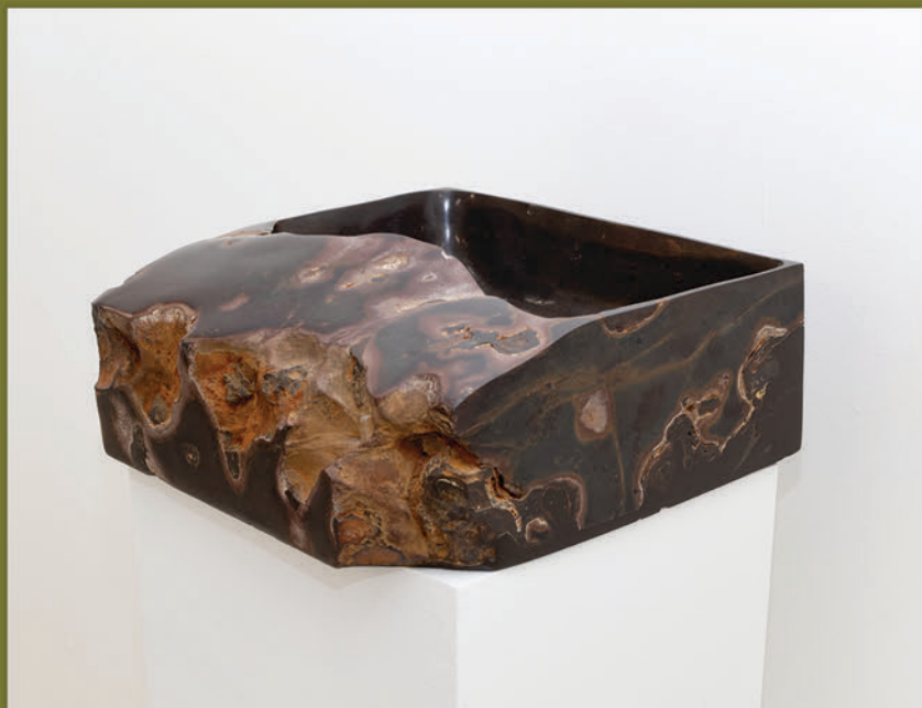
Hugo Zapata - Colombia