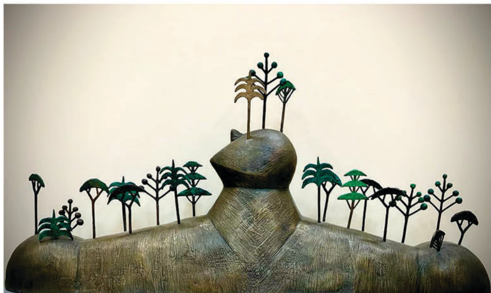
José Bedia - Cuba