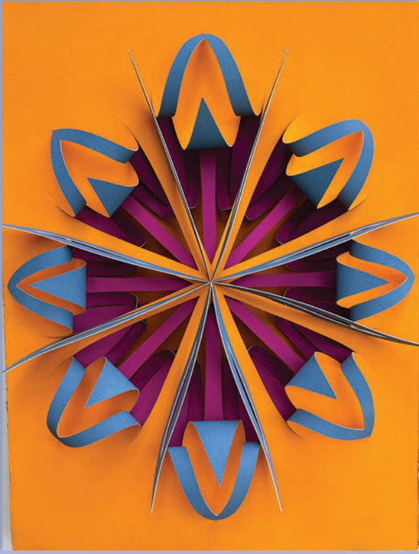
Sara Rayo - Colombia