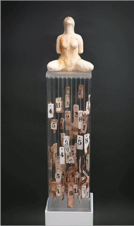
Aimee Perez - Cuba