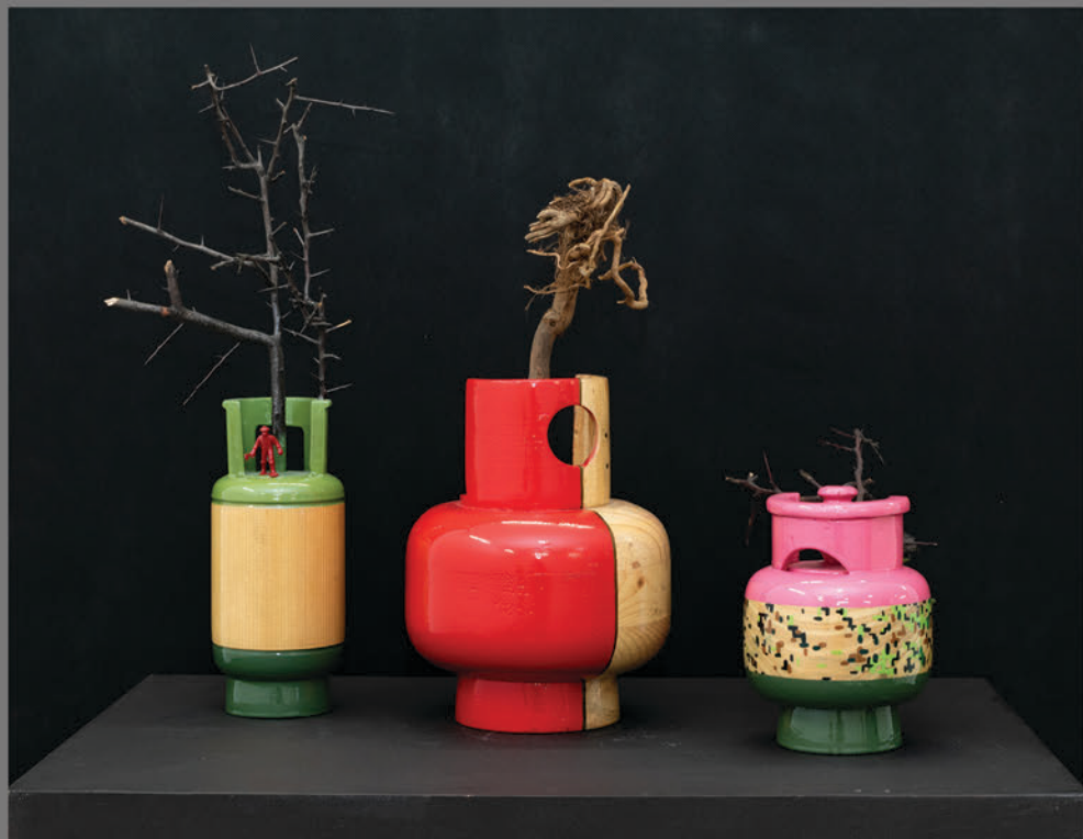
Oscar Villalobos - Colombia