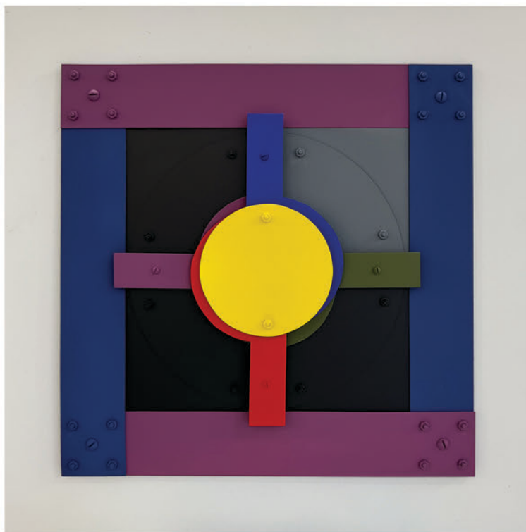
Edgar Negret - Colombia